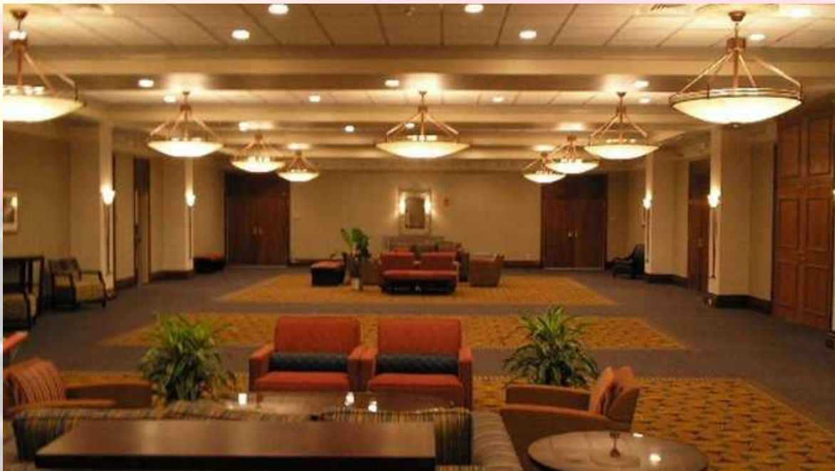
Picture of the Bottom Floor Foyer, doors to Centennial I & II are directly ahead.